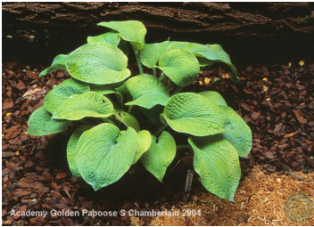
Registered Clump Photo