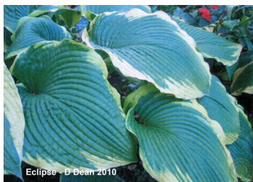
Eclipse - D Dean 2010