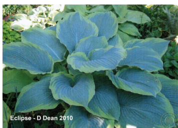
Registered Clump Photo