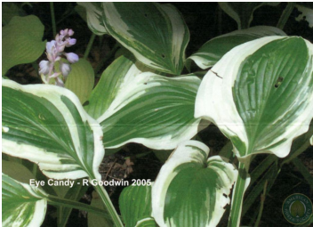
Registered Leaf Photo