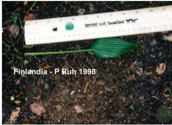
Registered Leaf Photo