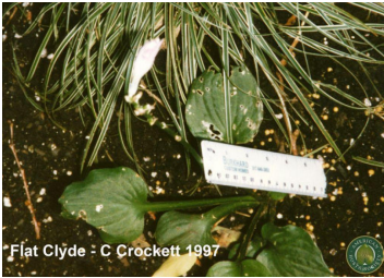
Registered Leaf Photo