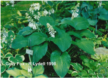
Registered Clump Photo