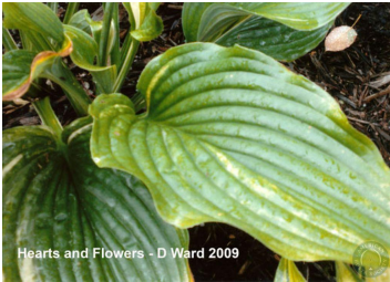
Registered Leaf Photo