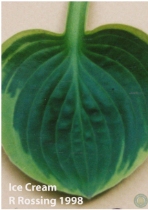
Registered Leaf Photo