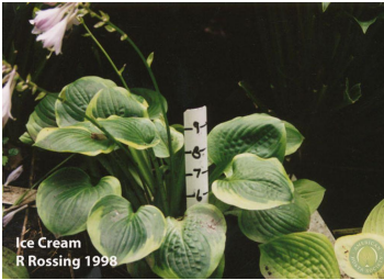
Registered Clump Photo