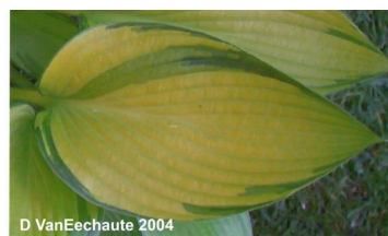
H. June Fever leafdetail Registered Leaf Photo