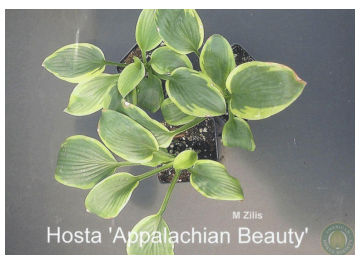
Registered Clump Photo