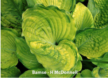
Bamse