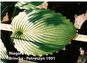
Registered Leaf Photo