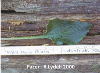
Registered Leaf Photo