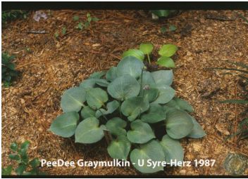
Registered Clump Photo