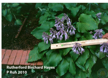
Registered Clump Photo