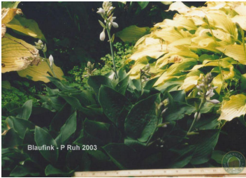
Registered Clump Photo