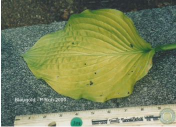
Registered Leaf Photo