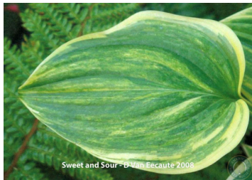
Registered Leaf Photo