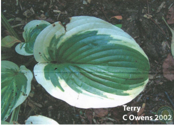
Registered Leaf Photo