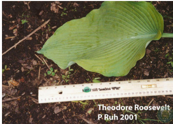
Registered Leaf Photo