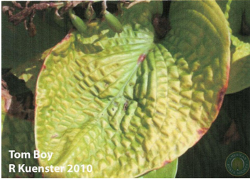
Registered Leaf Photo