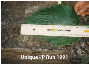
Registered Leaf Photo