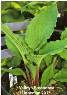
Registered Leaf Photo