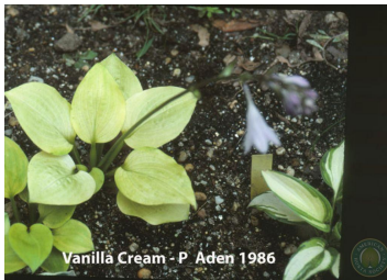
Registered Clump Photo