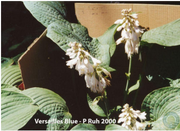
Registered Clump Photo