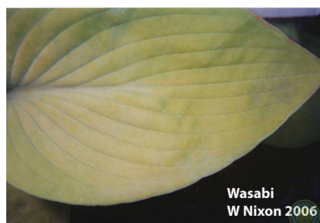
Registered Leaf Photo