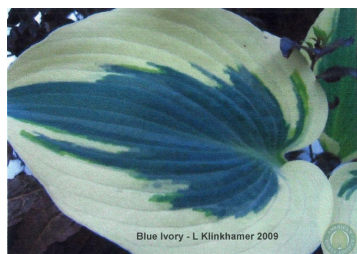
Registered Leaf Photo