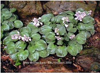
Registered Clump Photo