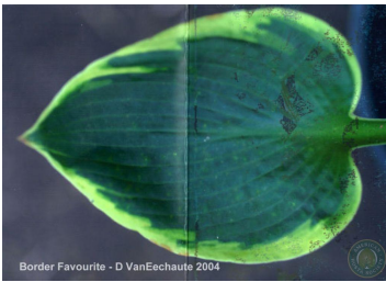
Registered Leaf Photo