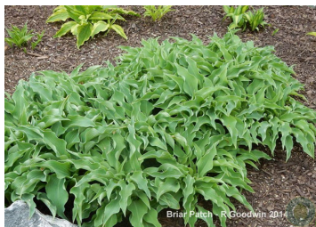
Registered Clump Photo