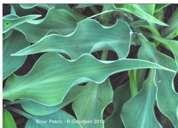
Registered Leaf Photo