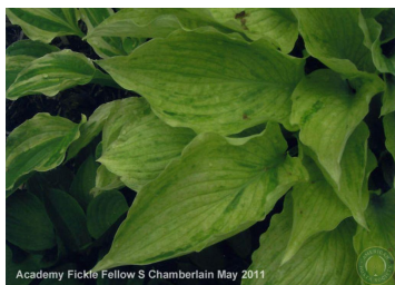
Registered Leaf Photo