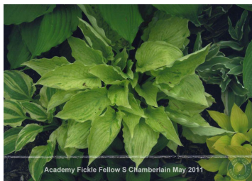
Registered Clump Photo